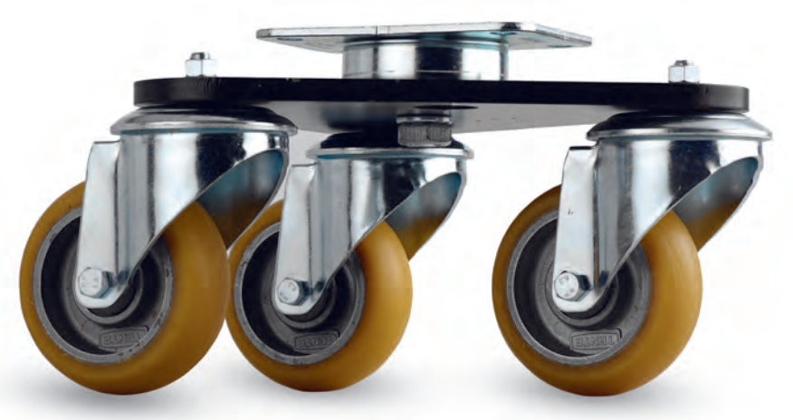
Shown with ITP Castors