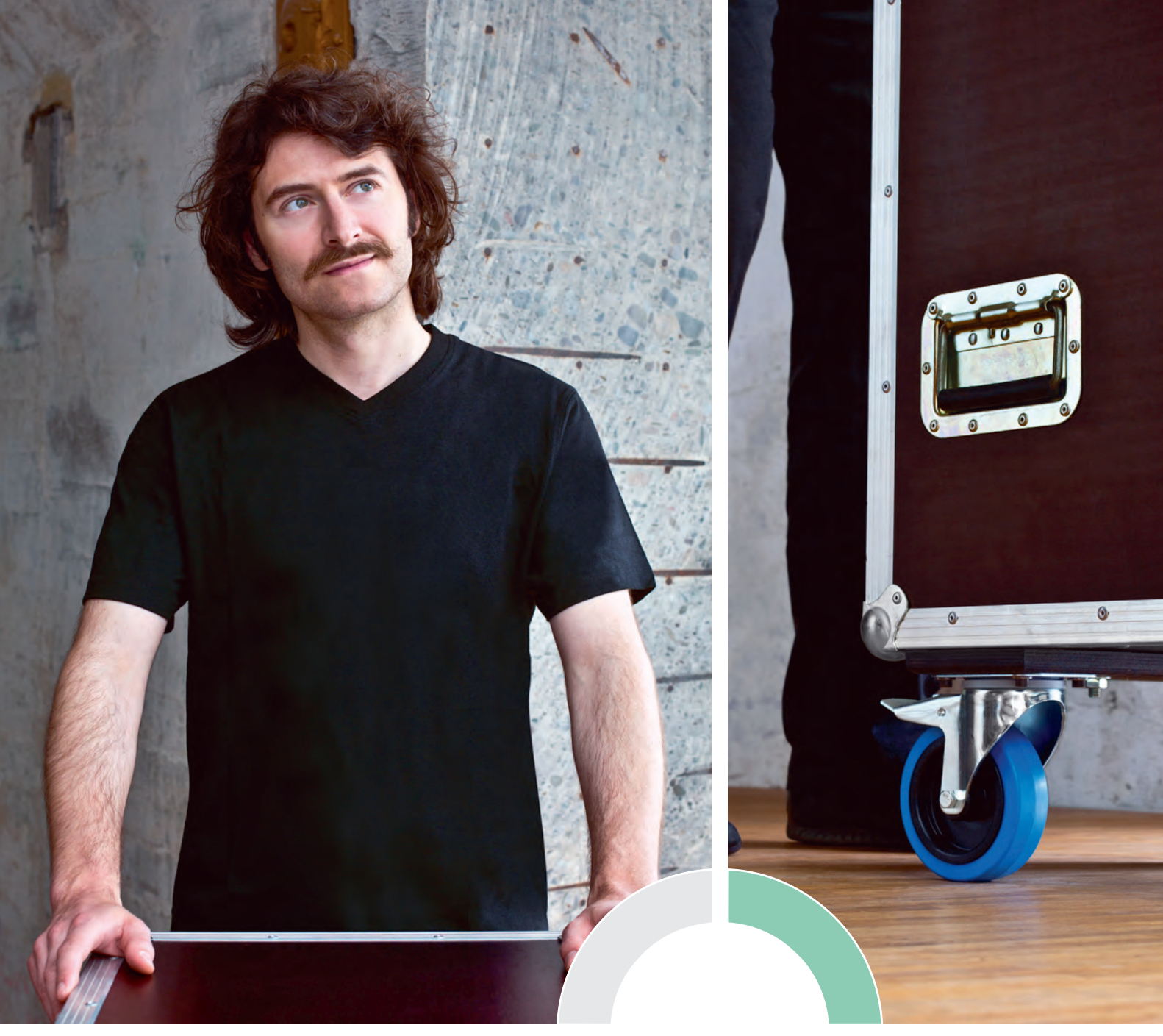
TENT E Industrial

Heavy loads – easily moved Stage and theatre castors