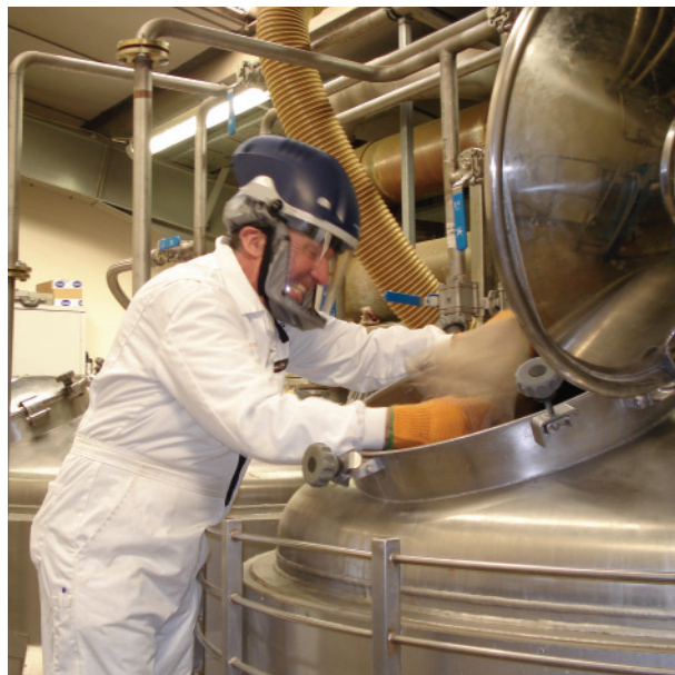
Food preparation and processing – for protection against powder inhalation and mixing splashing