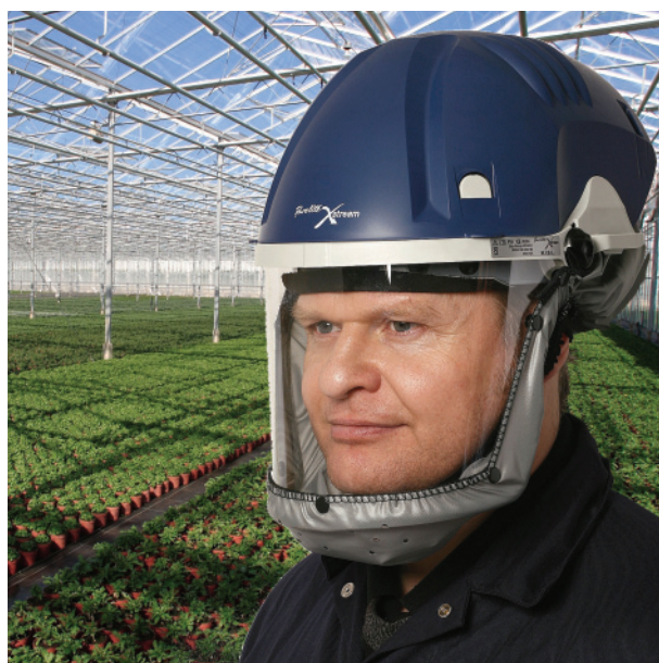
Agrochemical industry - the application of fertilisers and pest control treatments, harvesting and packing

The new Purelite Xstream is a self-contained lightweight Powered Air Purifying Respirator (PAPR) providing all-in-one respiratory protection against dust, fumes and particulates, combined with eye and face protection against impact and liquid splash.