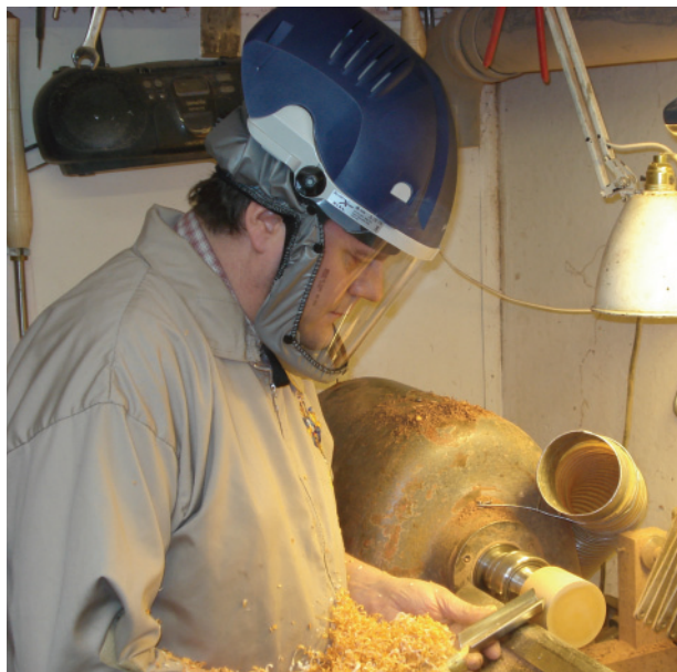
Woodworking and timber preparation - for protection against dust, flying particles, and preservatives