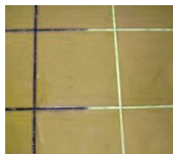
Tiles and Grout