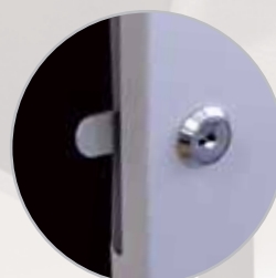
• Cam lock