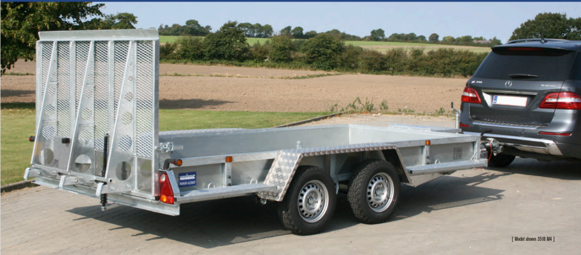
[ Model shown 3518 M4 ]

With parabolic leaf springs ensuring strength and high comfort