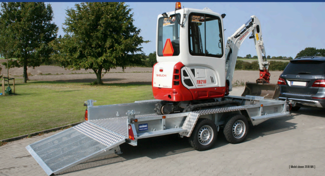
[ Model shown 3518 M4 ]

Professional and solid machine trailer with closed sides and 130 cm rear ramp