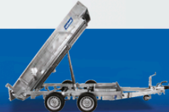
Parabolic leaf springs ensure high comfort and strength.

Inside box size: 300 x 170 x 30 cm Exterior box size: 306 x 176 x 30 cm Overall dimensions: 503 x 215 x 94 cm Gross weight: 3.500 kg Payload: 2.556 kg Wheel size: 12" Compact Axles: 2 axles, with brakes Side material: Steel Loading height: 45 cm Tipping angle: 48° Ramp angle: 12° Also available with gross weight from 3.500 kg to 2.700 kg