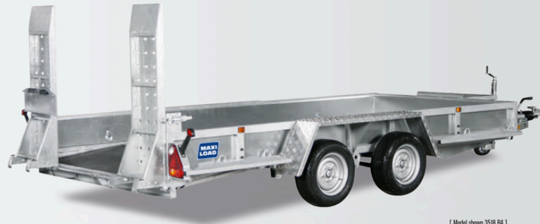
[ Model shown 3516 B4 ]