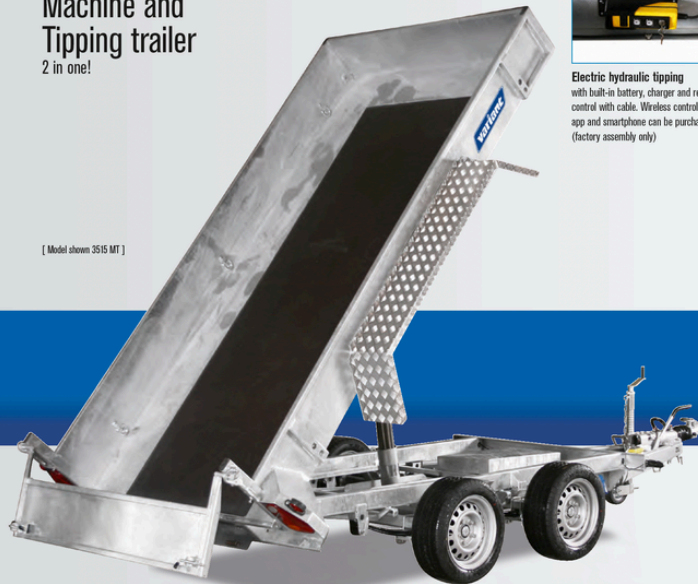
[ Model shown 3515 MT ]