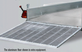
The aluminum floor shown is extra equipment.