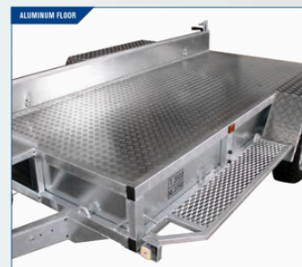
Increases the life of your trailer and provides safe and non-slip up and down of stock.