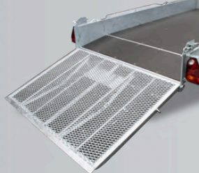
Complete rear ramp for easy rear overhang adjustment.