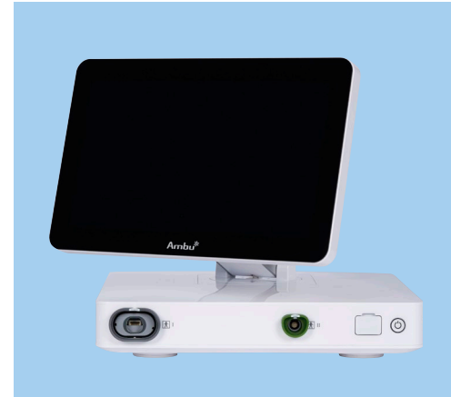
The compatible Ambu aBox 2 display and processing unit