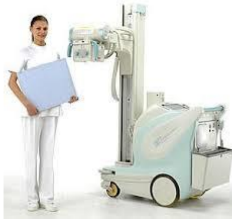
X Ray System (DICOM ready)