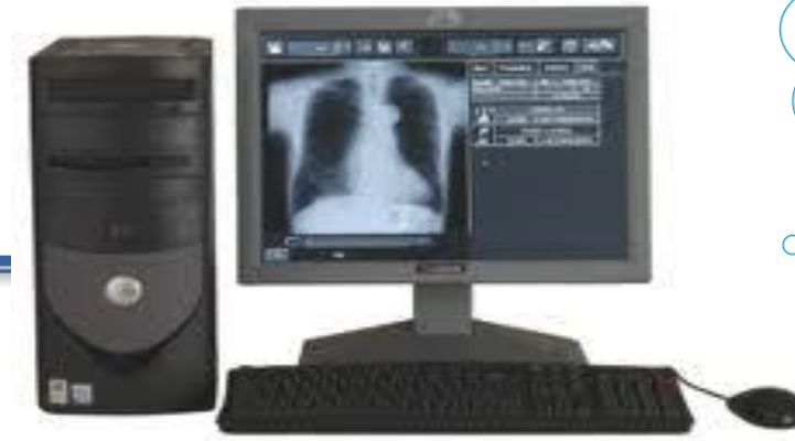
DICOM viewing workstation