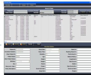
Worklist Editor (included)