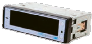
DIN RADIO MOUNT

Where tractor and trailer combinations are swapped, TruckWeigh II automatically recognises the overload monitoring system on the trailer, so there is no need to recalibrate every time the trailer is swapped.