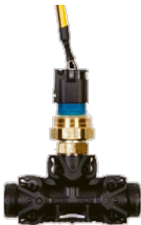
AIR PRESSURE TRANSDUCER

The packer plate shutdown function ensures overloading is prevented by inhibiting the compaction unit when the gross or net alarm point is reached. An override key switch allows the compaction unit to be switched back on by an authorised person.