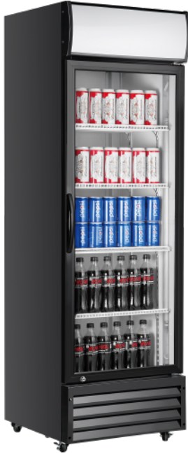
Single Door (Fan Cooling)