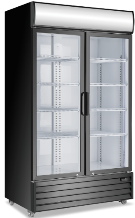
Hinged Door Cooler (Fan Cooling)