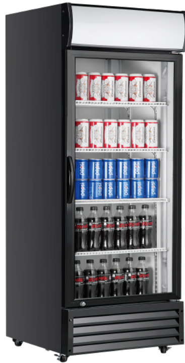
Single Door (Fan Cooling)