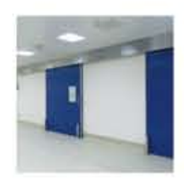
• Sliding Hygienic Doors