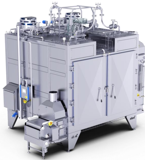
Spiral oven ASH PRO 600, 700 & 1000