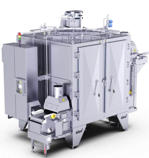
Spiral oven ASH PRO 400

Whether for smaller businesses or for large-scale production industry. Using the alco spiral ovens, you'll get the appropriate application technology for your product. We'd also be happy to develop a completely individual solution for your product idea.