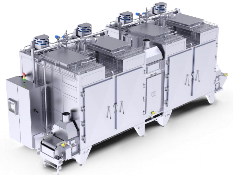
Spiral oven ASH TWIN PRO