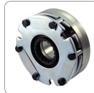
Fail Safe Brake