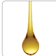
Food Grade Oil and Grease