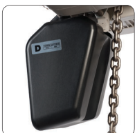
Plastic Chain Container