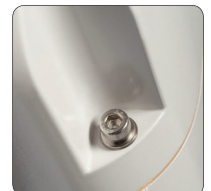
Stainless Steel and Nickel-Plated Hardware

Shown with options: white epoxy paint, motorised trolley, stainless steel hook, nickel-plated stopper and stainless steel chain container