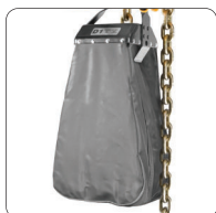
Fabric Chain Container