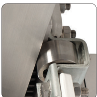
Stainless Steel Guide Roller (MR2)