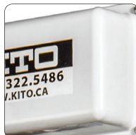
White Epoxy Paint