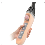
Protective Silicone Pendant Cover