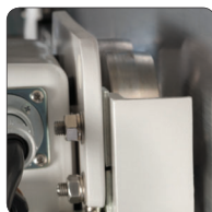
Stainless Steel Trolley Wheels