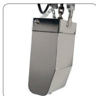
Stainless Steel Chain Container