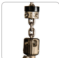
Stainless Steel Rubber Cushion and Nickel Plated Stopper on 0.5t and 1t