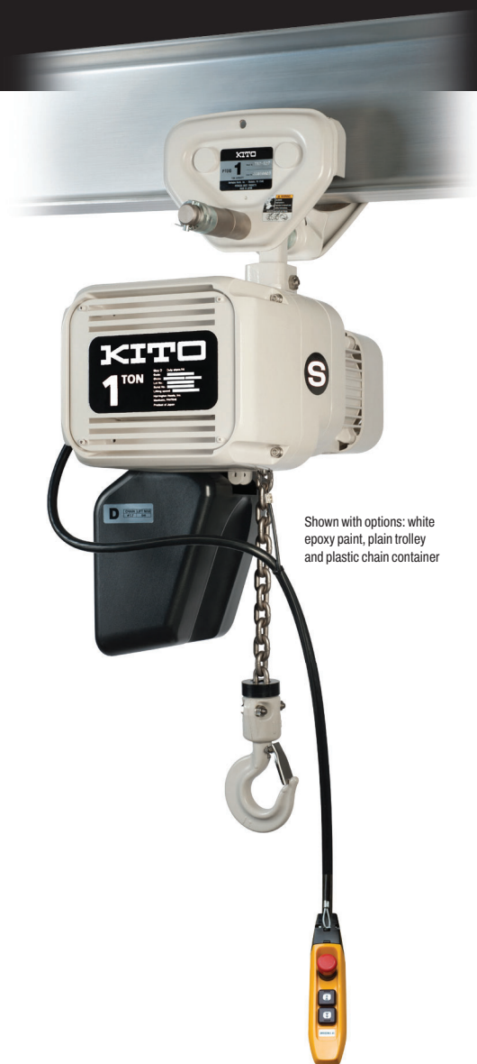
Shown with options: white epoxy paint, plain trolley and plastic chain container

Kito Crosby Australia 46 McKellar Way Epping 3076 VIC, Australia Tel: 1300 792 262 Email: sales.australia@kitocrosby.com kitocrosby.com.au