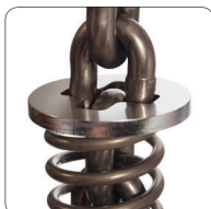
Stainless Steel Chain Spring and Limit Plate on 2t