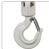
White Epoxy Bottom Hook