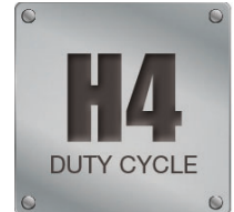
Extreme Duty TEFC Motor