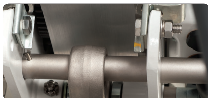
Nickel-Plated Suspension Shaft and Suspender