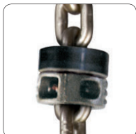
Stainless Steel Rubber Cushion and Nickel-Plated Stopper on No-Load Side