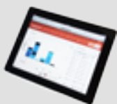
PFREUNDT Web Portal