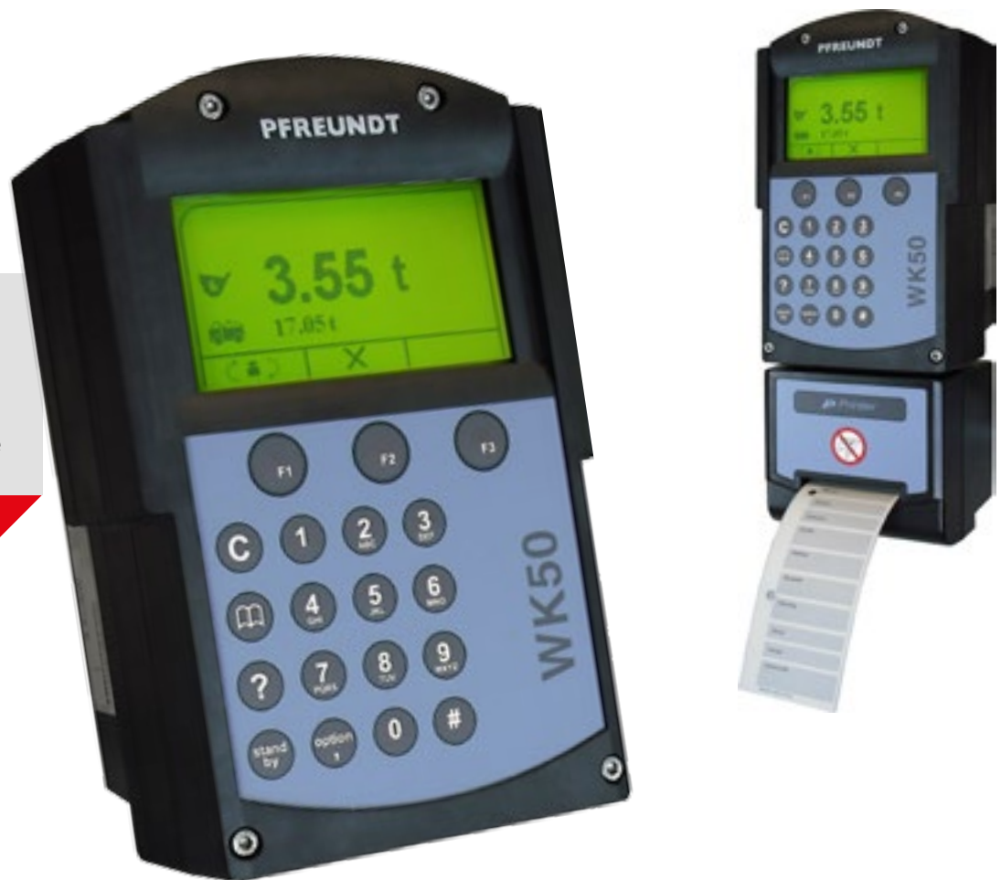
Display example, wheel loader