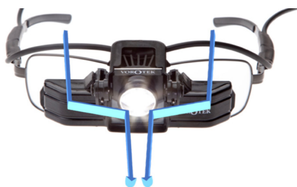
Figure 1. 12mm Converged Binocular Optical pathway.

The Integrated Converged Binoculars can easily be rotated in and out of use. Upward rotation of the Converged Binoculars allows uninterrupted vision, with or without headlight illumination.