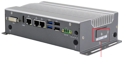
SIM card Slot