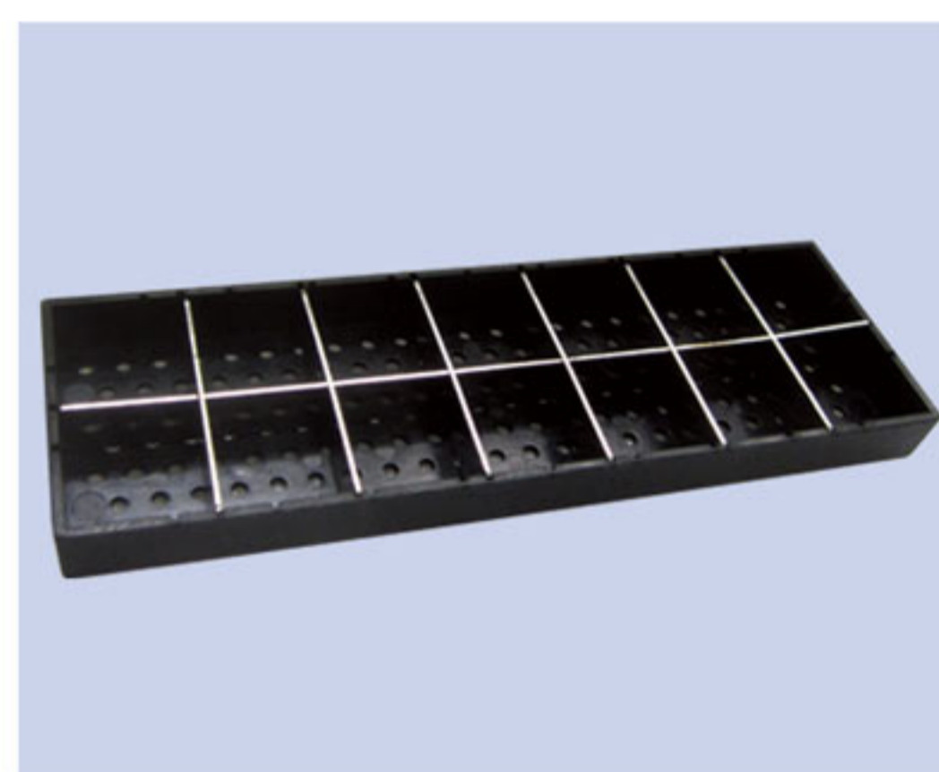
2X7 grid panel for large tissues