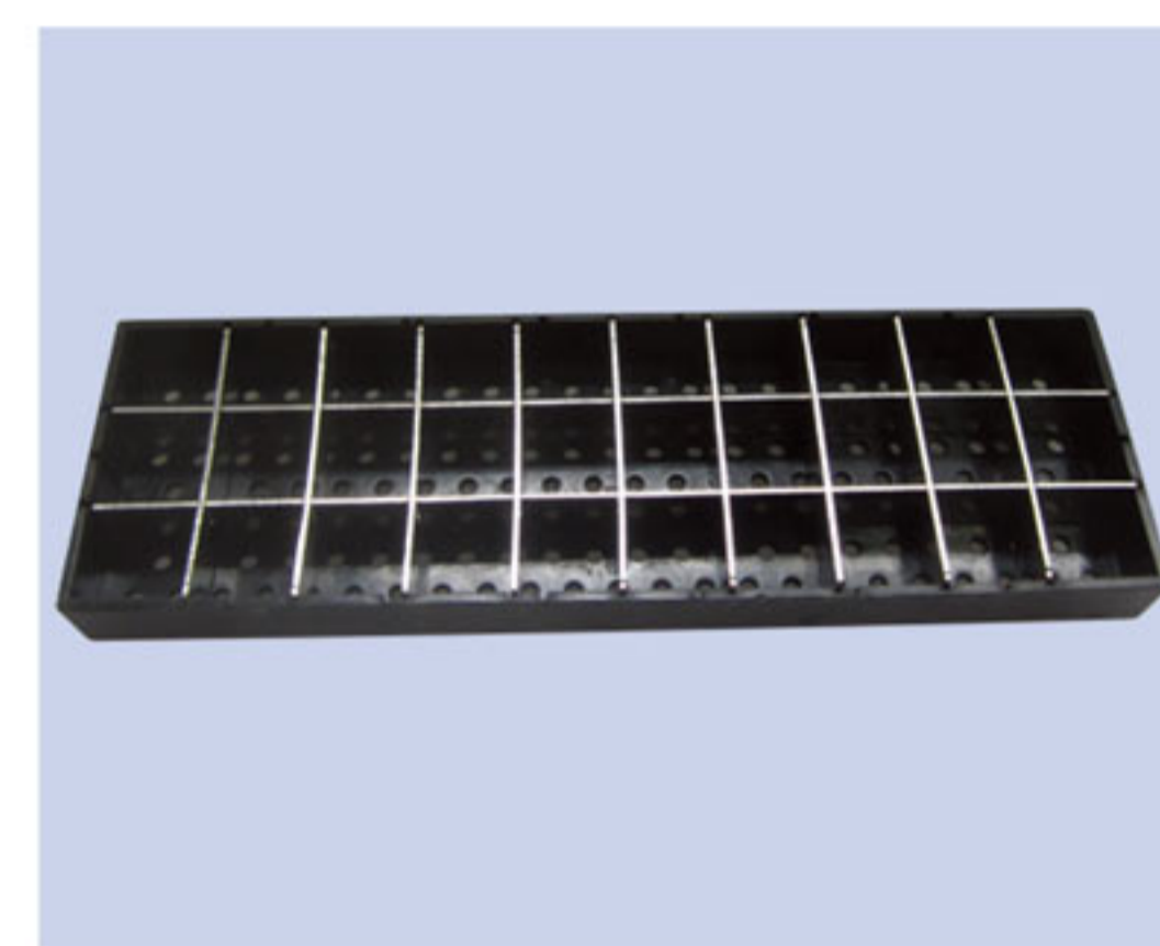
3X10 grid panel for small tissues