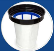
WASHABLE ULTRA FINE FILTER