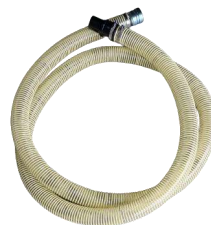
Add Another 5 Metres Of Vacuum Hose