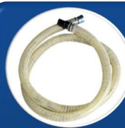
5 METRES OF 2.5" VACUUM HOSE