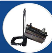
DRUM TIPPER FOR EASY HANDLING