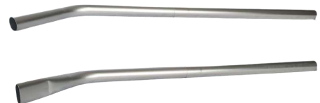
L Rod Crevice & Open End

Applied Cleansing Solutions Pty Ltd | F2/ 10-14 Tower Court Noble Park VIC 3174