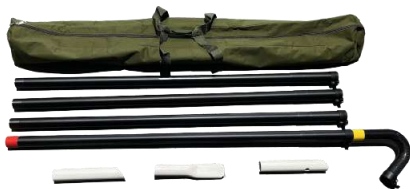
Supreme Carbon Fiber Clean From The Ground Kit