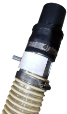
Large Item Vac Release Cuff