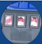
THREE BYPASS VACUUM MOTORS