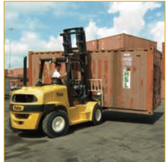
Various truck configurations

The optional Techtronix 332 transmission features controlled ramp descent , limiting roll to three inches per second, electronic inching (requires no adjustment), and the Auto Deceleration System , bringing the unit to a complete stop when the accelerator pedal is released. Tire spin is reduced by precisely regulating engine speed during controlled power reversals .