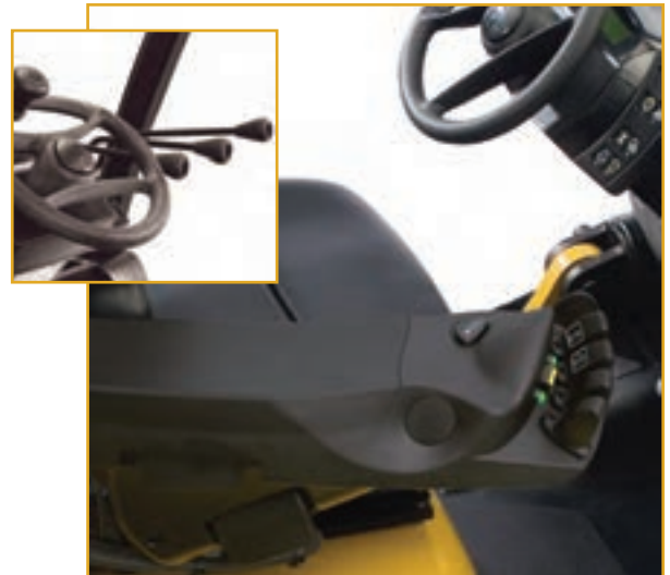
Ergonomic hydraulic controls

A low step height provides easy entry and exit. The standard, cowl-mounted manual hydraulic levers also allow easy access for right-side entry/exit. Yale's overhead guard design also offers plenty of headroom with excellent visibility even at higher fork heights.