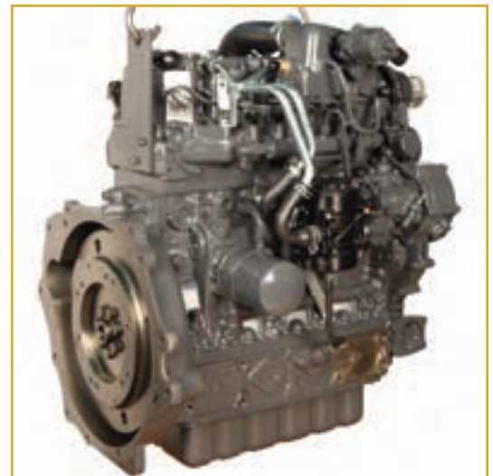
Kubota 3.8L EPA Certified Tier 4 final turbo diesel Engine