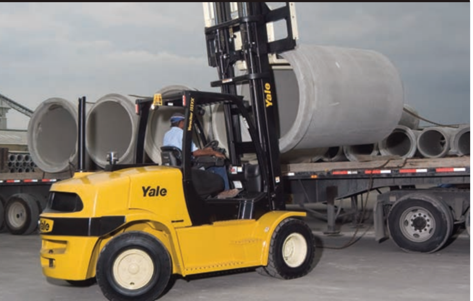
All trucks shown with optional equipment

As a leader in materials handling, Yale® offers so much more than the most complete line of lift trucks. Yale has invested heavily in people, processes and capital equipment to encompass the cornerstones of quality and dependability... Innovative Design, Comprehensive Testing, Highest Quality, Advanced Components and Superior Manufacturing.