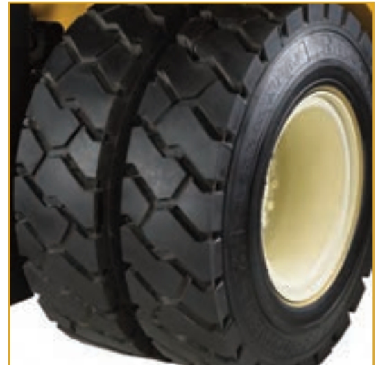
Increased tire life

Yale has improved serviceability of the Veracitor® VX series and reduces the labor cost involved with periodic maintenance and unscheduled repairs. Simplified daily checks and reduced service requirements lead to lower maintenance costs.