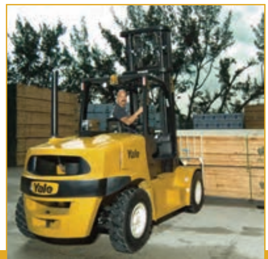
Auto Deceleration System