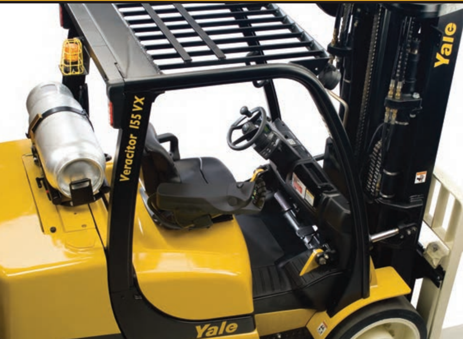
All trucks shown with optional equipment

Operators prefer our trucks. Operator comfort is enhanced by the increased foot space in the well designed operator's compartment. The isolated powertrain reduces noise and vibration minimizing operator fatigue and increasing operator productivity throughout a shift. Excellent operator visibility is afforded through the Yale Hi-Vis™ mast.