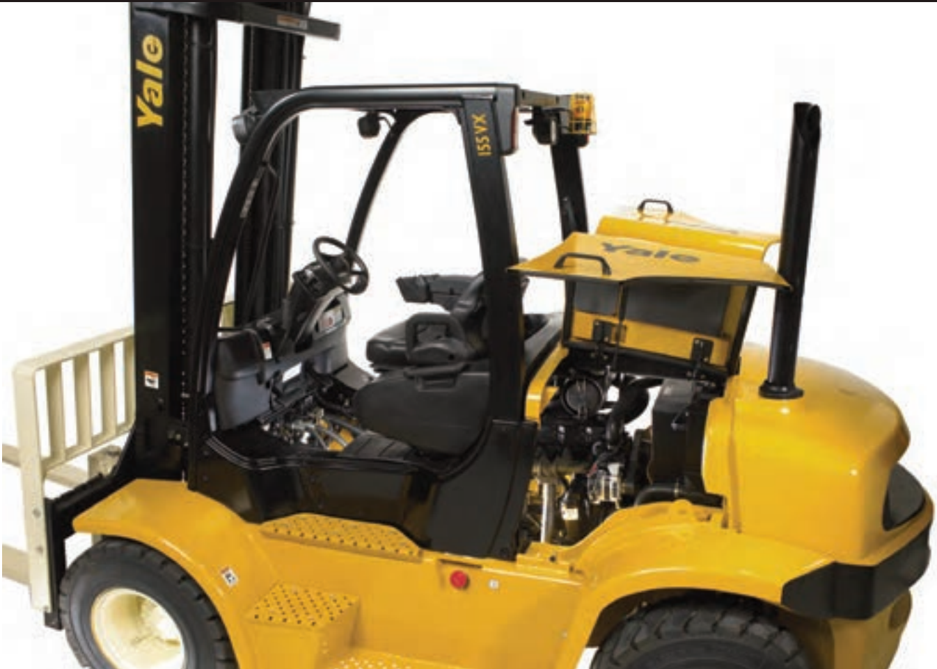
All trucks shown with optional equipment

Not only is the Veracitor® VX series designed to require less maintenance, it is also designed to be extremely easy to service. From the gull-wing engine covers and on-board diagnostics, to the reliable, most comprehensive parts availability in the industry, these trucks were designed with service details in mind. It's the new standard in truck serviceability.