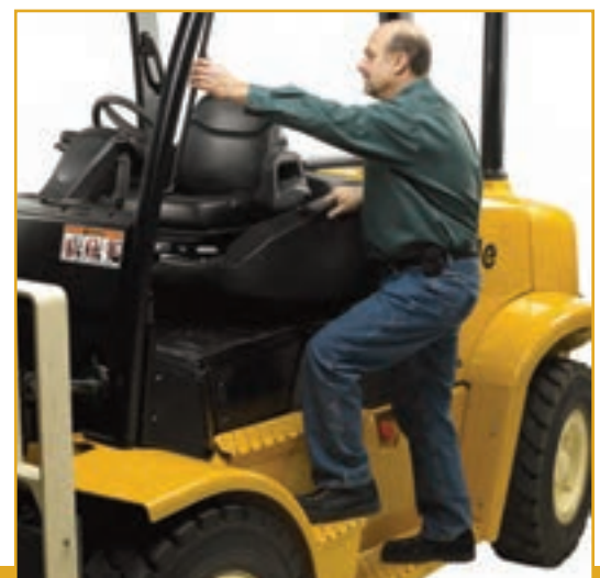
Low step height