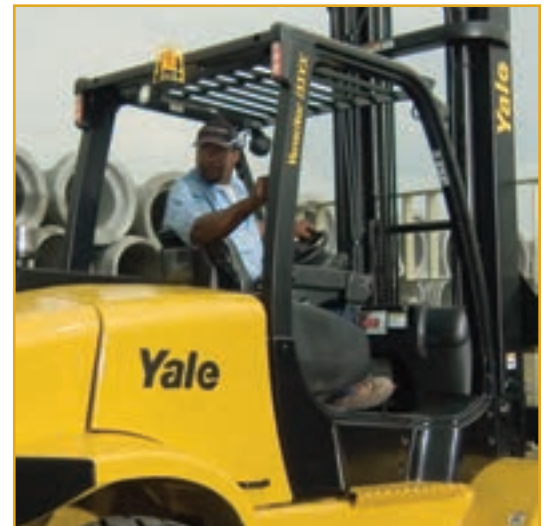
Rear driving comfort