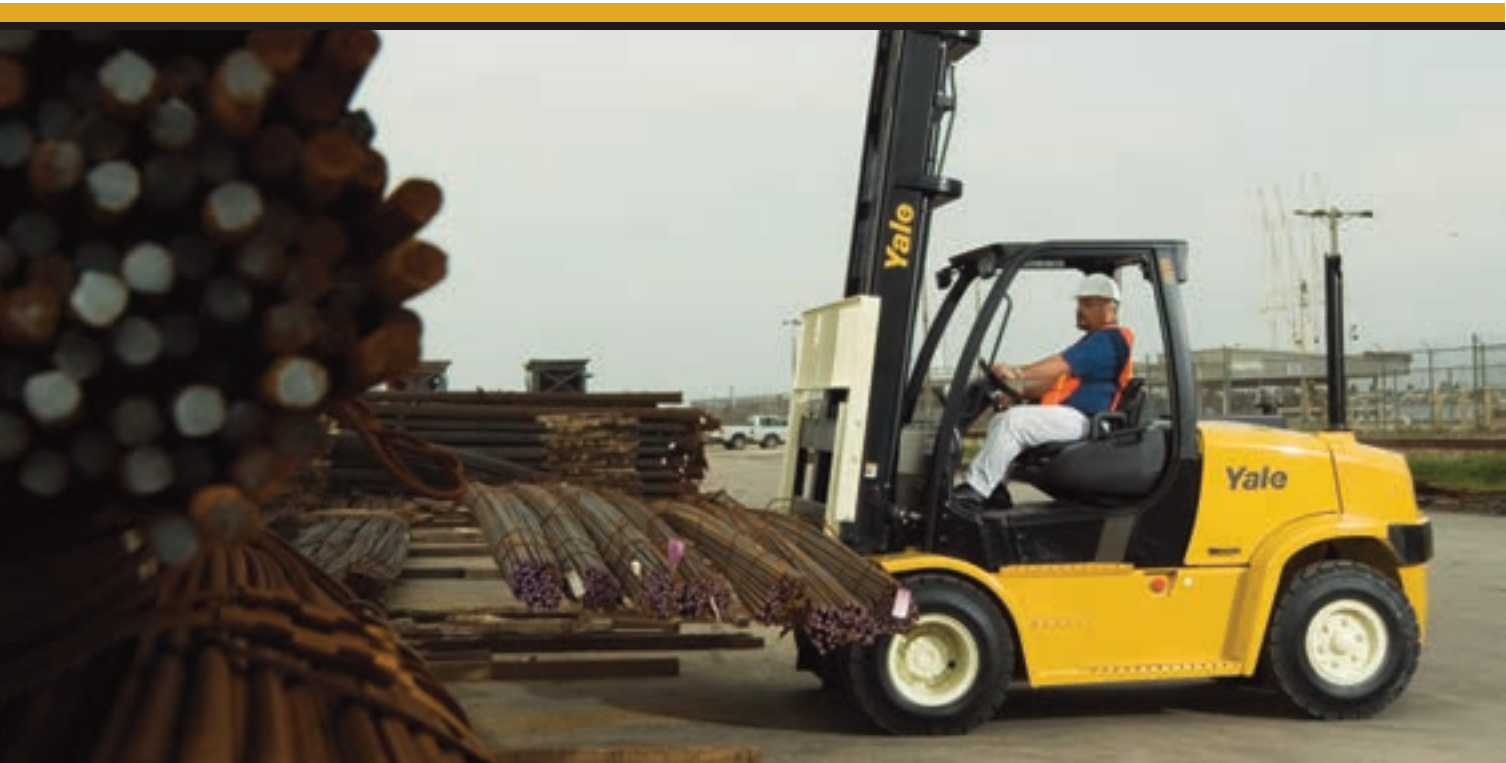
All trucks shown with optional equipment

Various configurations are designed to meet and exceed your specific application requirements. The Yale Veracitor® VX Series productivity cost savings are achieved through lower truck operating expenses, reduced labor costs, reduced operator overtime expense and additional savings with increased throughput. The combination of engine and transmission options allows you to configure a truck to your specific applications. These trucks help achieve savings through reduced labor costs and reduced operator overtime.