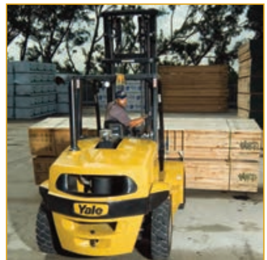
Controlled direction changes