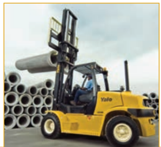
Reduced labor costs