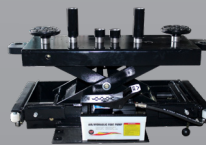
RJ45 Rolling Air Pump Jack