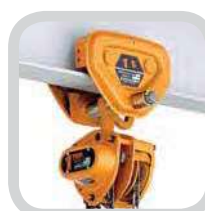
TSP push trolley 500kg – 5T