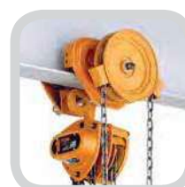
TSG geared trolley 500kg – 10T