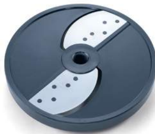
Fine-cutting disc F1

The finest vegetable or fruit slices for refined Asian salads or desserts