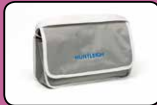
ACC34 Soft Carry Pouch