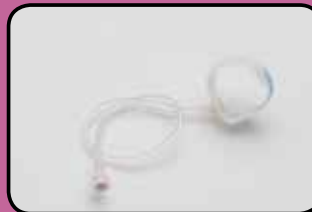
ACC163 Digit/Toe Cuff with Colder Connector (pack of 5) CL(1.9cm)