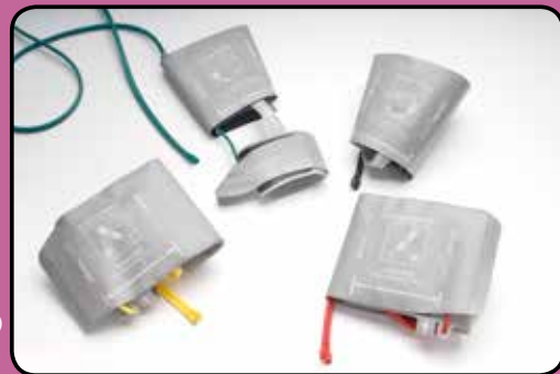
ACC- VAS-007 Large Right Arm Cuff ACC- VAS-008 Large Right Ankle Cuff ACC- VAS-009 Large Left Arm Cuff ACC- VAS-010 Large Left Ankle Cuff ACC- VAS-011 Large Adult Cuff Set (34-46cm) (4 cuffs as shown in image)

CONTACT CUSTOMER CARE 35 Portmanmoor Road, Cardiff, CF24 5HN, United Kingdom T: +44(0) 29 2048 5885 F: +44(0) 29 2049 2520 E: sales@huntleigh-diagnostics.co.uk