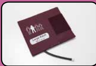
ACC160 Large Arm/Ankle Cuff with Colder Connector CL(31-40cm)