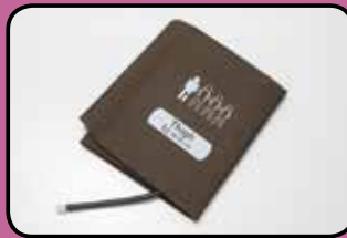
ACC161 Thigh Cuff with Colder Connector CL(38-50cm)