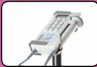
ACC52 Dopplex Stand