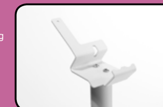
ACC52-2 Doppler stand (DMX Dopplers)