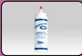
ACC3 Aquasonic Gel (box of 12x250ml)