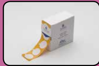
ACC56 Adhesive Rings (roll of 500)