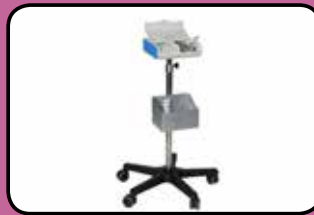
ACC180 Dopplex Stand for Dopplex MD200