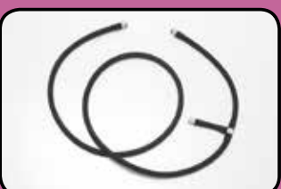
ACC- VAS-028 Toe Cuff Inflator system (DMX Doppler Only)