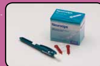
ACC224 Neuropen and Tips - includes 10g monofilament