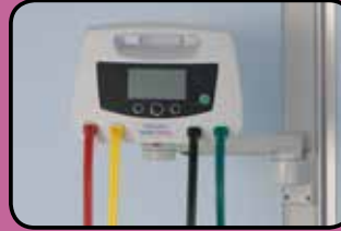
ACC- VSM-154 Wall Mount (Requires Fixing Plate)