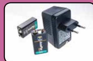
ACC171 Battery Charger (UK) (D900 / SD2 dopplers only)