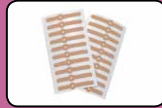
ACC179 Adhesive Straps (pack of 240)