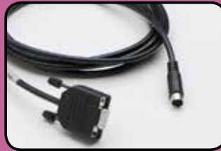
ACC35 Reporter cable