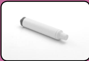
VP4XS High Sensitivity 4MHz Probe