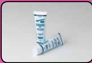
ACC24 Ultrasonic Gel - (box 12 x 60ml tubes)