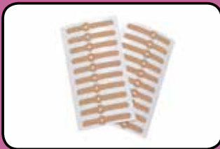
ACC179 APPG2 Adhesive Straps (pack of 240)

CONTACT CUSTOMER CARE 35 Portmanmoor Road, Cardiff, CF24 5HN, United Kingdom T: +44(0) 29 2048 5885 F: +44(0) 29 2049 2520 E: sales@huntleigh-diagnostics.co.uk