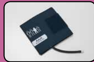
ACC159 Arm/Ankle Cuff with Colder Connector CL(23-33cm)