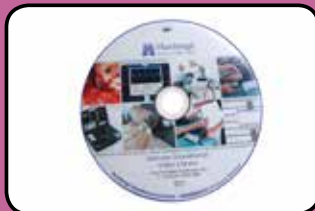
DVD-VL Vascular Educational Video Library