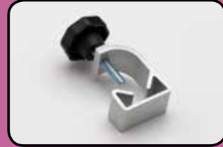
ACC47 IV Pole Clamp