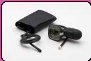
ACC188 Blood Pressure Cuff & Aneroid Sphygmomanom- eter with Colder Connector