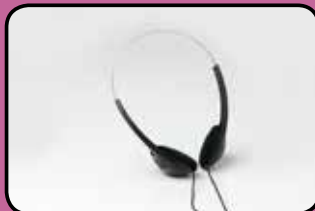
ACC21 Stereo Headset