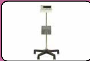
ACC103 Polestand - Mobile Trolley