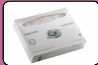
ACC- VAS-016 Infection Control Sleeves (box of 100)