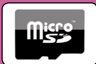
ACC227 Micro SD card - DMX only