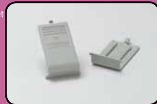
SP-726486 Battery Cover (D900 / SD2 dopplers only)