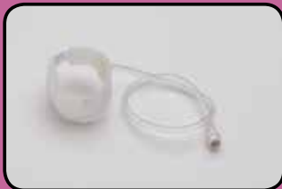
ACC185 Digit/Toe Cuff Colder (3 Large/3 Small)