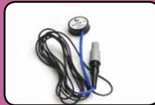
VPPG1 Venous PPG Sensor