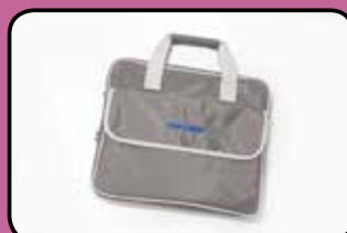
ACC- VAS-029 large carry bag - kits only