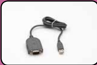
ACC190 RS232-USB Adaptor (use with DR4)