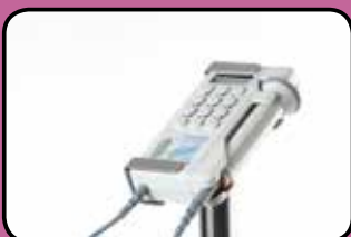
ACC52 Doppler stand MD2 only