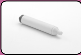
VP10XS High Sensitivity 10MHz Probe