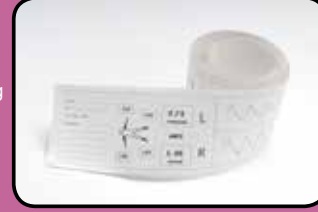
ACC- VAS-017 Standard Thermal Paper (pack of 5 rolls) ACC- VAS-019 Self Adhesive Thermal Paper (pack of 5 rolls)