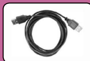
ACC-VAS-030 3m USB cable for use with DR5

CONTACT CUSTOMER CARE 35 Portmanmoor Road, Cardiff, CF24 5HN, United Kingdom T: +44(0) 29 2048 5885 F: +44(0) 29 2049 2520 E: sales@huntleigh-diagnostics.co.uk