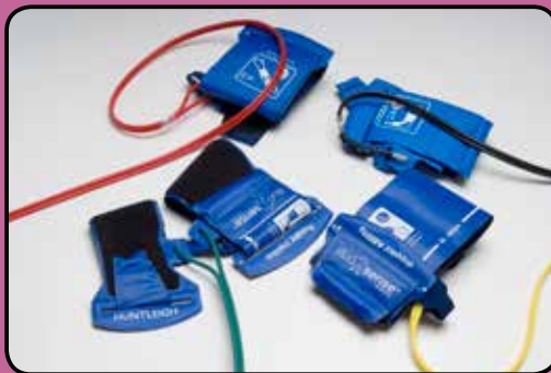
ACC- VAS-023 Adult Right Arm Cuff ACC- VAS-024 Adult Right Ankle Cuff ACC- VAS-025 Adult Left Arm Cuff ACC- VAS-026 Adult Left Ankle Cuff ACC- VAS-027 Adult Cuff Set (22-36cm) (4 cuffs as shown in image)