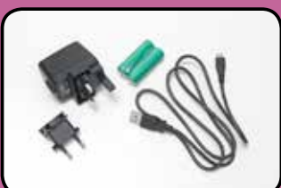
ACC266 Medical Grade Rechargeable Kit (DMX range only)