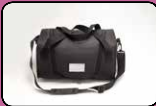
ACC- VAS-015 Carry Bag