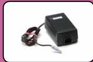
Acc105 Battery Charger