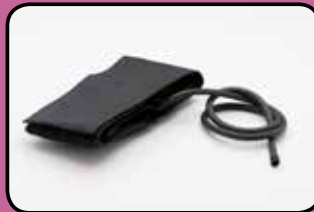
ACC164 Tourniquet Cuff with Colder Connector