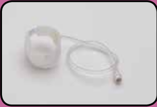
ACC185 Digit/Toe Cuff with Colder Connector Pack of 3 large & 3 small included