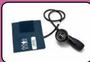
ACC188 BP Cuff+ BP Gauge with COLDER