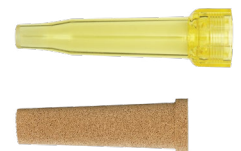
Nozzle and filter sold separately