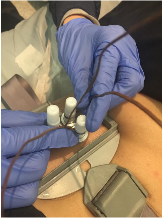
FIGURE 1: heat measurement following hyperthermic treatment.