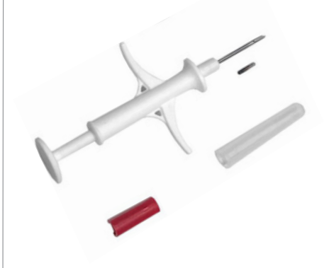
Cybortra Mini Microchip