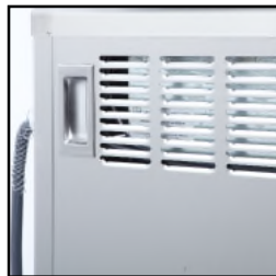
Shown with standard pull handles