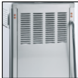
Shown with optional rear mix lights