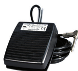
A803 Footswitch †

The Derm 102 has a bipolar mode going up to 10 watts