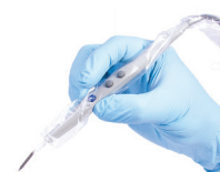
A910ST Sterile Handpiece Sheath †