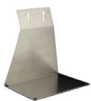
A813 Table Top Stand †