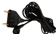
A827V Forcep Cable †