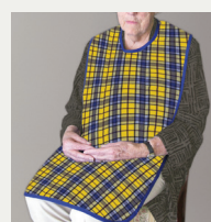
Yellow Plaid Code: SB CPY