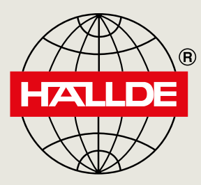
Food Preparation Machines Made in Sweden