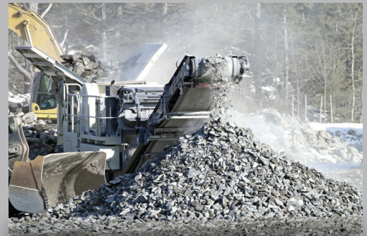
PORTABLE with ANGLE SENSOR

Daily, weekly, monthly, yearly, and resettable job totals, along with calibration and production data logs are stored on the internal USB drive for verification of production at each jobsite.