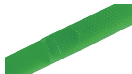
Friction Weld Sealing Technology