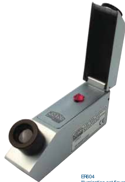
ER604 Illumination not figured