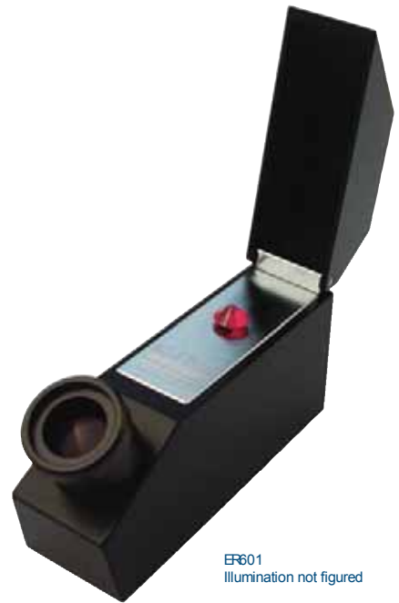
ER601 Illumination not figured

Gemstone refractometers are used for the classification and quality control of gemstones. The gemstone to be examined is simply placed on the prism with a drop of contact fluid. The refractive index of the gemstone is read through the ocular of the refractometer. The refractive index is an important parameter in classifying a mineral or gemstone. Each mineral has its typical refractive index, due to its chemical composition and crystalline structure. Our gemstone refractometers are characterised by their particularly sharp image and good readability. With the sodium filter that only lets through light with a wavelength of 589 nm, the refractometer can be used as a mobile unit with an ordinary light source or with sufficient ambient lighting. LED illumination is also available with a wavelength of 589 nm.