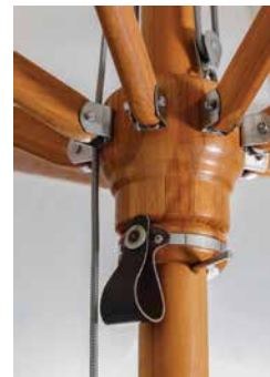
EASY-GLIDE ROPE PULLEY SYSTEM

Frames are made of Kiln Dried Eucalyptus Hardwood sourced and manufactured in South Africa. They come with a 3 year warranty against mechanical defects.