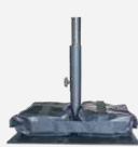
BASE PLATE & SANDBAGS