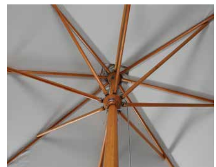
CLASSIC TIMBER STYLING