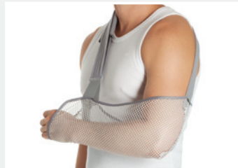
Economy Arm Sling