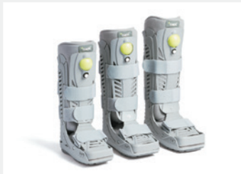
Full Shell Walker