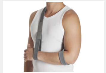
Collar and Cuff