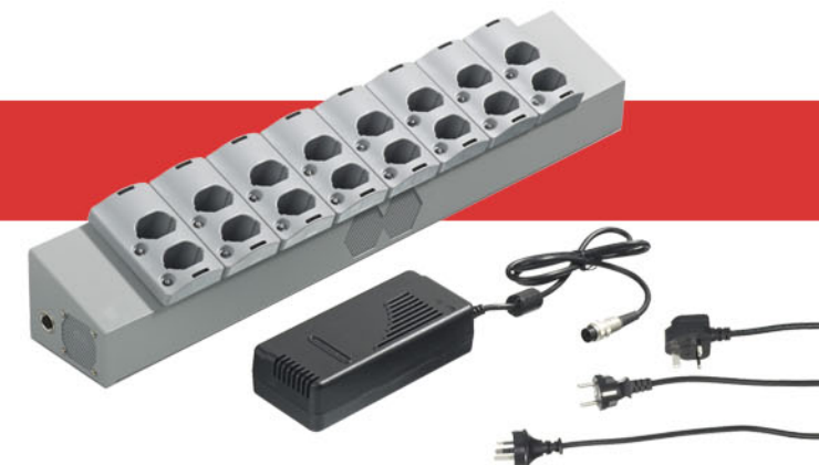
Optional 16 Way Multicharger

Audio visual alerts when filter change is required!