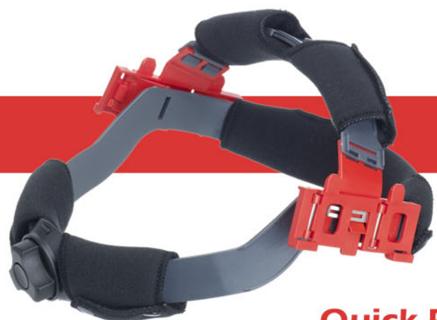
Quick Release Headband as standard