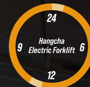
Charge for 1 hour, work for 12 hours