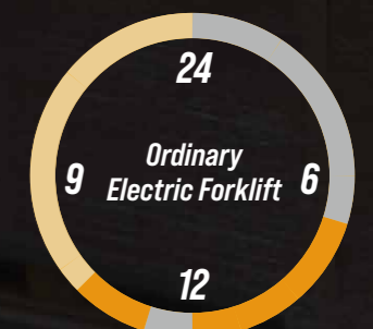
Slow charging, need spare battery, high cost, complicated management