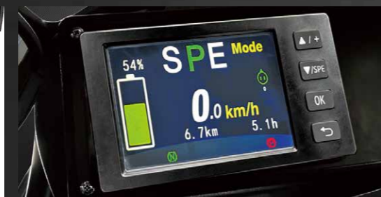
Multifunctional color-screen instruments