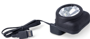
UCT: Single USB Charger