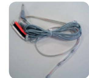
Esophageal ECG Probe Combines 3-lead ECG, temperature and respiration into one probe, compatible with the Cardell® Touch.