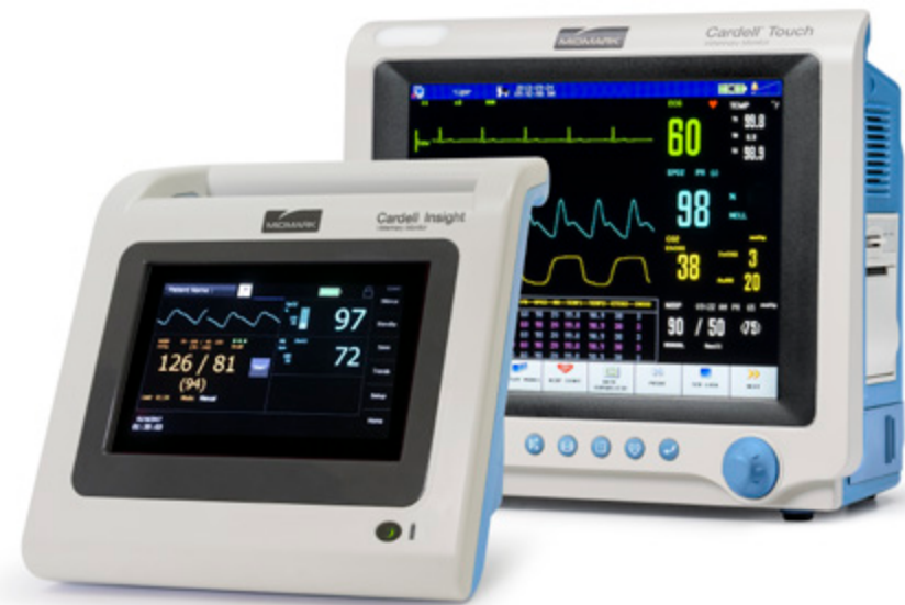
The Cardell® Family of Monitors

Monitoring solutions that deliver unmatched performance in exam, treatment and surgery.