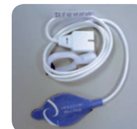
MAXFAST-1 Reflectance Sensor Can be applied to the tail (wrap included), designed for head and neck surgery or dental procedures.