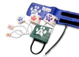
Cardell® BP Kit Seven cuff sizes ranging from 2 – 10 cm in width, made from a soft, hypoallergenic material and a complimentary Cardell® Cuff Selector.