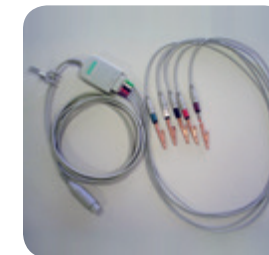
ECG Cables and Lead Wires Paired with copper clips, designed to be malleable and ultra-conductive. Includes electrode gel to help sustain readings.