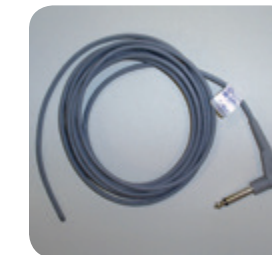
YSI Temp Probes Designed to be durable and deliver accurate readings from either end of the patient. Large probe is included with the Cardell® Touch.