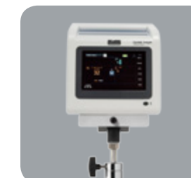
Stand and Mounting Options Rolling stands and other mounting options available, designed to help protect your investment and allow for easy movement. All rolling stands feature a storage basket.