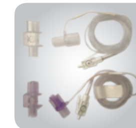
CO 2 Sampling Tubes and Adapters Available in two sizes to help minimize dead space. Sidestream sample lines have built-in filters for moisture management without messy water traps.