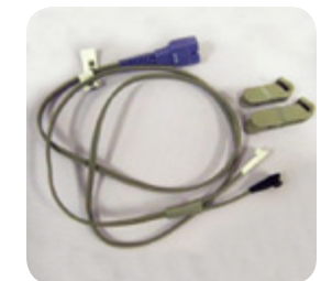
Nellcor® V-SAT Pulse Oximeter Sensors Durable non-slip clips in two sizes. Can be applied to the tongue, lip, ear, toe-webbing, prepuce or vulva. Ten foot extension cable is also available.