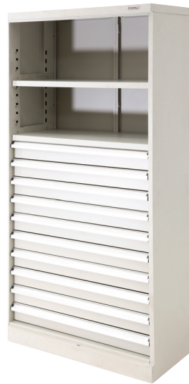
Doors can be removed if preferred