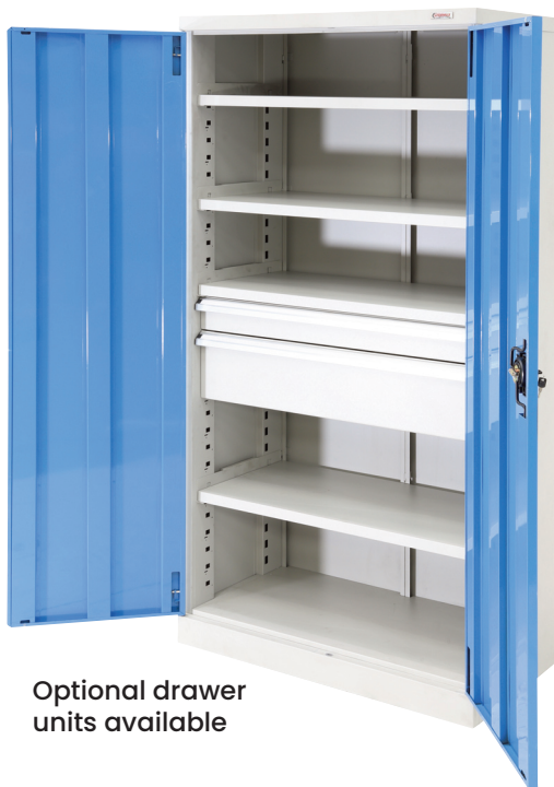
Optional drawer units available