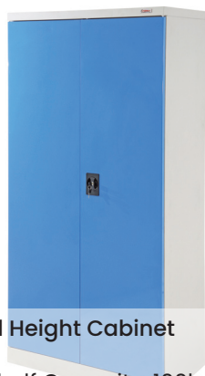
Full Height Cabinet