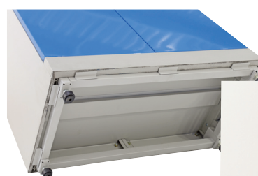
Cabinet base stand available