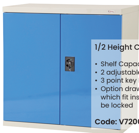
1/2 Height Cabinet