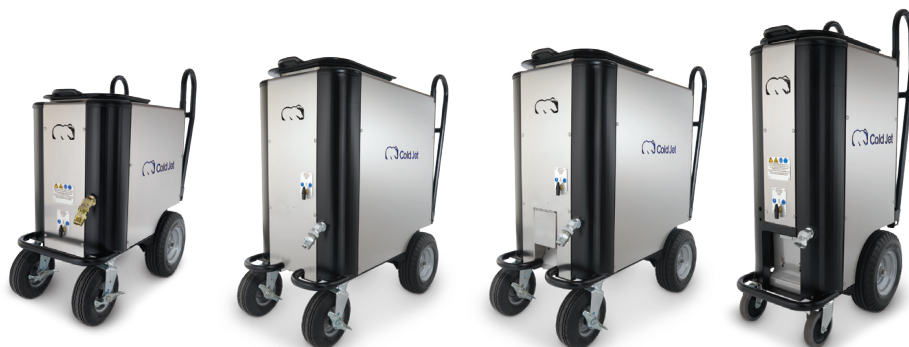
Aero 40/40 HP

The Aero Line offers superior performance and versatility with or without electricity. Regardless of the size of your project or budget, from the compact Aero 40 to the all-pneumatic Aero C100, Cold Jet has the right solution to meet your needs. Contact Cold Jet to determine the best solution for your application.