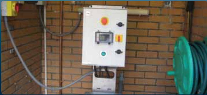
Siemens Control Panel