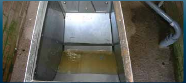
View inside macerator