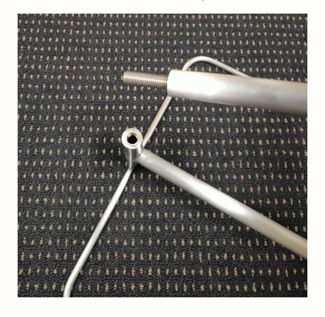
Threaded Rod & Tray Frame

Place the rod with the threaded end and screw into the underside of the rectangular tray frame until all the way in.