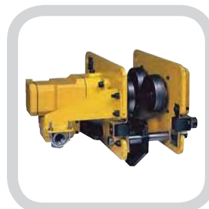
MTH Series Air Trolley In conjunction with the EHL Air Hoist