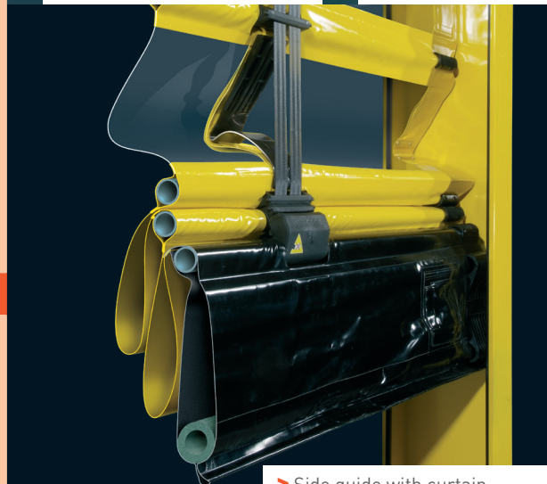
> Side guide with curtain