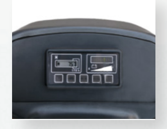
Informative LCD Dash Display