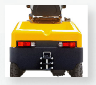
Easy Service Access via Back Cover