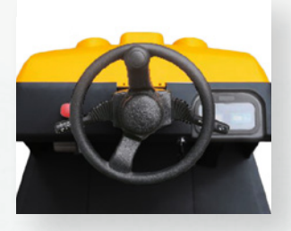
Ergonomic Operator Compartment