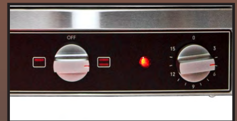
Now with more control of the cooking process