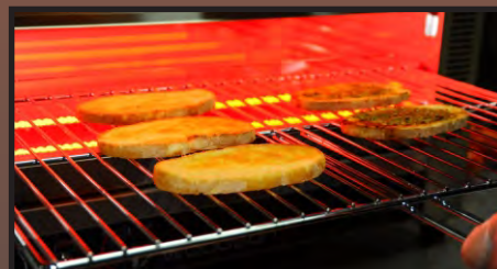
The instant heat of the infra-red elements