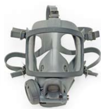
S-face mask first breath