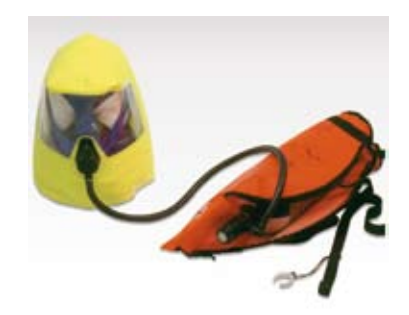
Spiroscape - an easy to use escape unit with protective hood