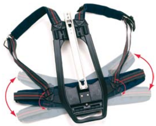
The pivoting system