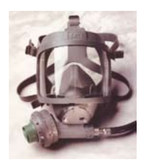
Revitox - resuscitation unit with quick coupling for Spiromatic