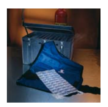
Cooling vests to lower body temperature and heat stress