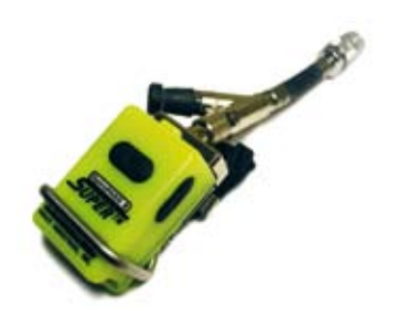
A full range of PASS (Personal Alert Safety Systems) equipment