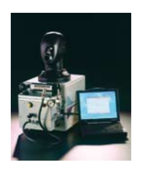
Test equipment for different applications