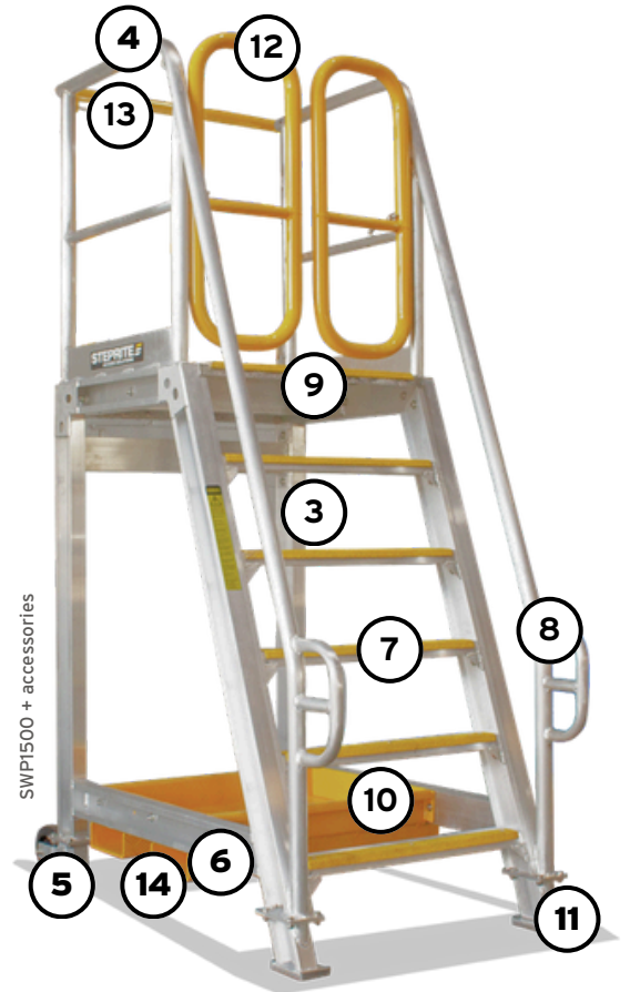
Safety Access Platform Ladders