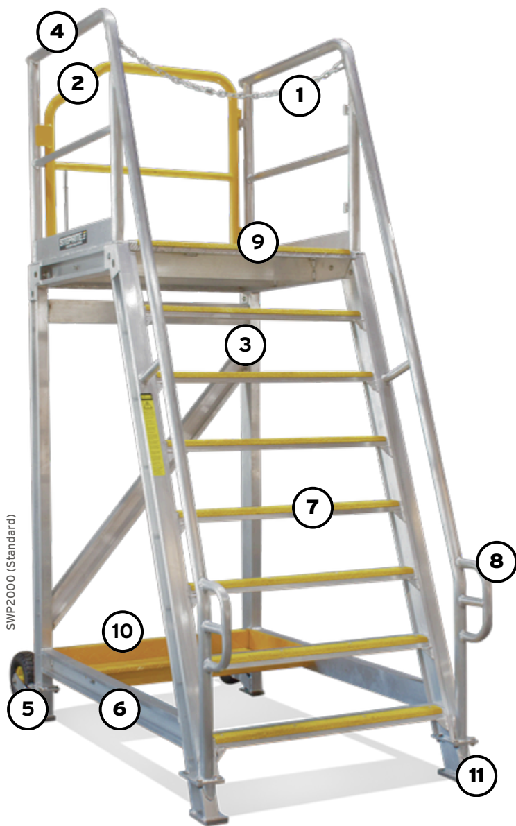
Safety Work Platform Ladders