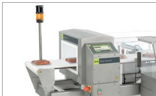
VARICON+W with modular belting for "wet" area applications