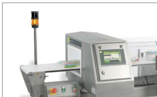
VARICON+D with C-SCAN GHF high sensitivity detection head.