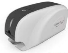
Rewritable ID CARD PRINTER smart-31R