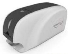
Single sided ID CARD PRINTER smart-31S