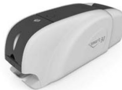
Dual sided ID CARD PRINTER smart-31D